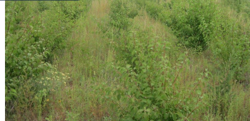
An American plum shrub thicket planting after 6 years. Most shrubs are now producing fruit!