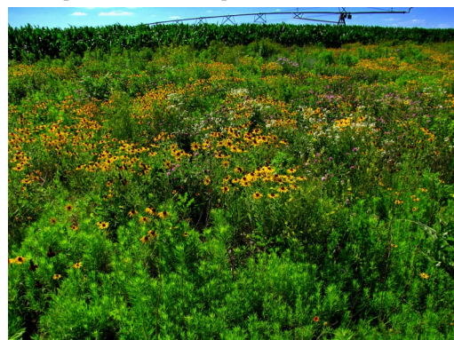
High diversity grass and wildflower mixes are used in the CFW program to provide excellent nesting and brood rearing cover as well as pollinator benefits.