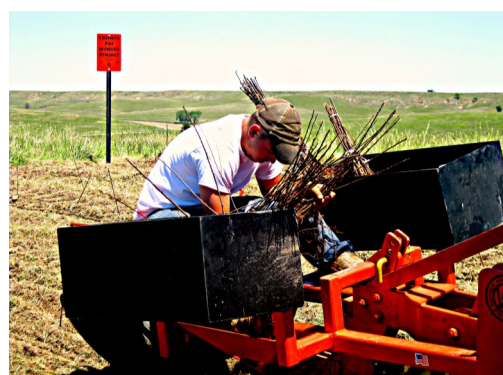
The Corners for Wildlife program is designed to help establish wildlife habitat on center pivot corners not capable of sustaining high yields when planted to row crops.

The CFW program is a popular option among landowners. Landowners receive a rental payment for a five-year contract to establish and maintain high diversity wildlife habitat on areas associated with a center pivot.