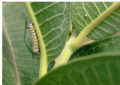
Common milkweed is essential to the monarch butterfly life cycle. Common milkweed is included in CFW seed mixes to increase habitat for monarchs.