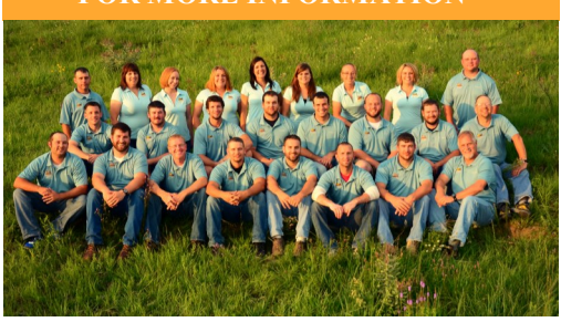
Through a partnership with Pheasants Forever and Quail Forever, Nebraska Game & Parks Commission and the Natural Resources Conservation Service, wildlife biologists are available to help provide wildlife habitat guidance, technical assistance on the available conservation programs and design seeding mixtures.

For further information visit NebraskaPF.com or call 844-733-3669.