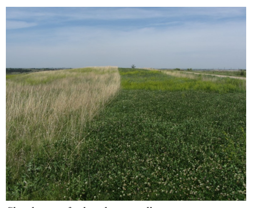
Shred green firebreaks annually to maintain maximum benefit. If eligible, apply to hay them the year before a burn to remove excess residue.