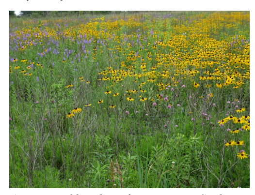
A two year old seeding of nesting cover. Seedings with lower rates of grass will develop more slowly, maintaining nesting and brooding value without management for longer periods of time.