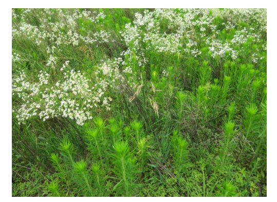
Annual weeds and wildflowers create excellent structure in high quality habitat.