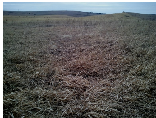
This field of smooth brome field that was hayed in August and chemically treated following the first hard freeze in October.