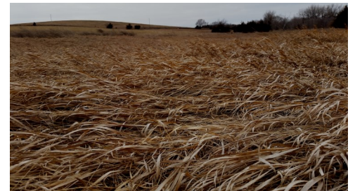
A lack of structural integrity provides poor winter cover. The buildup of litter at ground level also renders it useless for brood rearing.