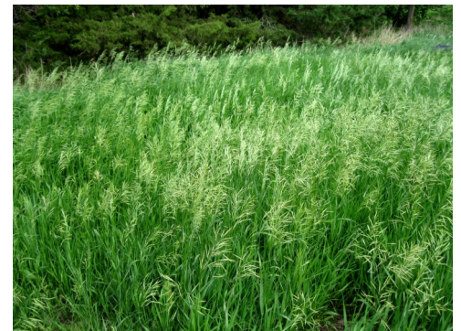
Smooth brome outcompetes native plant species which are beneficial to wildlife and creates a “monoculture.”

High intensity short duration grazing (HISD) mimics the “mob grazing” concept. By running high stocking rates for short spans of time, cattle are forced to graze everything in the unit rather than selecting the most palatable forage. HISD can be accomplished on larger units by moving an electric fence to create temporary paddocks. For brome control, it’s important to intensively graze the brome patch hard until May 15 or June 1. Then, allow rest to give the warm season grasses such as Indian grass and Big Bluestem a chance to emerge.