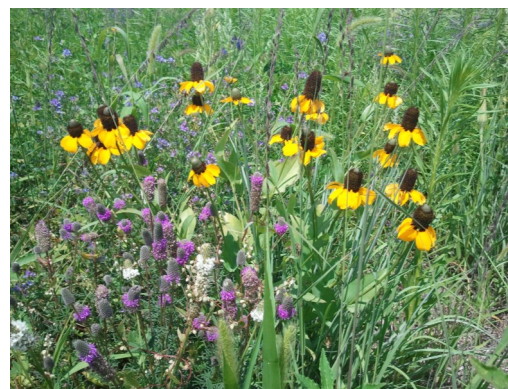
Purple prairie clover, coneflower, and foxtail are valuable to wildlife for the insects they attract and the seed they produce. These plants respond to open space created by haying and chemical application the previous fall.