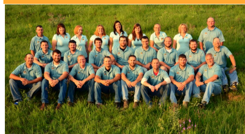
Through a partnership with Pheasants Forever and Quail Forever, Nebraska Game & Parks Commission and the Natural Resources Conservation Service, wildlife biologists are available to help provide wildlife habitat guidance, technical assistance on the available conservation programs and design seeding mixtures.

For further information visit NebraskaPF.com or call 844-733-3669.