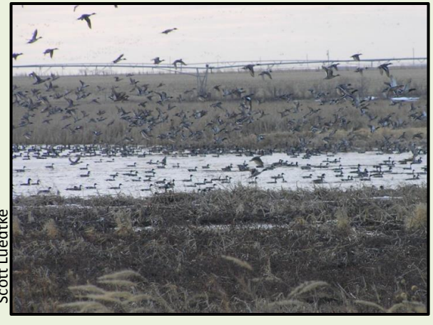
Rainwater Basin Wetland Project

WILD Nebraska funding can be used on any wildlife habitat project agreed to by the landowner and partners. Emphasis will be placed on landscape scale work targeted in Biologically Unique Landscapes (BULs), as designated by the Nebraska Natural Legacy Project. Projects located in designated BULs may also have additional funding available.