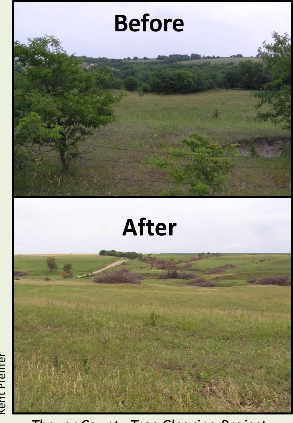
Thayer County Tree Clearing Project

Use of program funds and practice rates can vary based on partner and landowner contributions. Funding levels will be determined based on individual project needs. Rates are influenced by recently completed work or other methods.