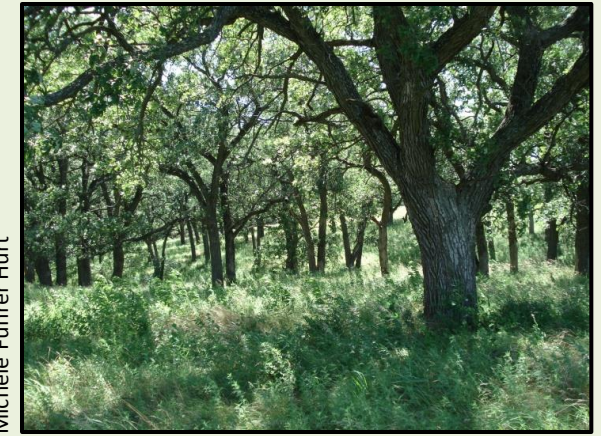
Gage County Oak Woodland Project

As the needs of wildlife and landowners continue to grow and evolve, WILD Nebraska funding is designed to work in concert with the funding sources of other agencies, such as USDA (Farm Bill), NPLT, USFWS, NFS, NWTF, etc.