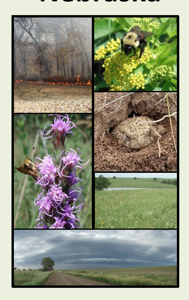
Partnerships for Wildlife Habitat