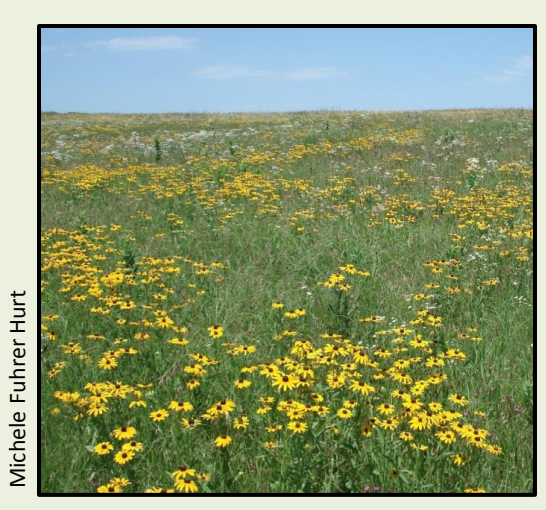
Gage County hay meadow project

WILD Nebraska is a partnership between the NE Game and Parks Commission and Natural Resource Districts that provides landowners opportunities to improve wildlife habitat on their lands. Projects are mostly on working lands and will promote good land stewardship while conserving existing habitats, emphasizing long-term sustainability.